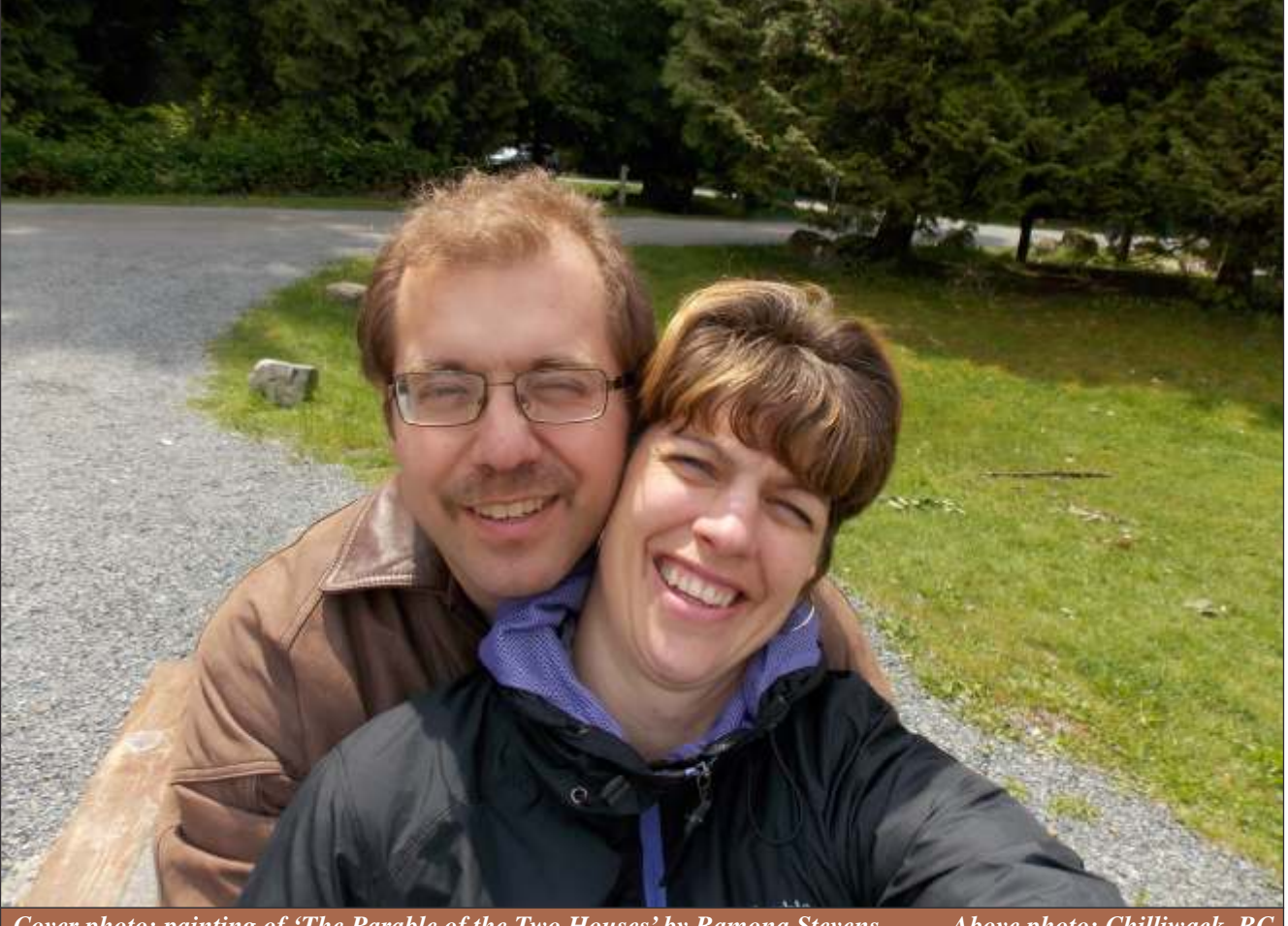
Cover photo: painting of 'The Parable of the Two Houses' by Ramona Stevens