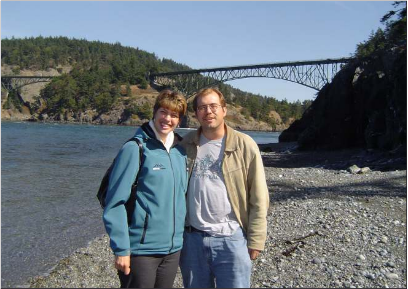
Cover photo: Powell River, BC