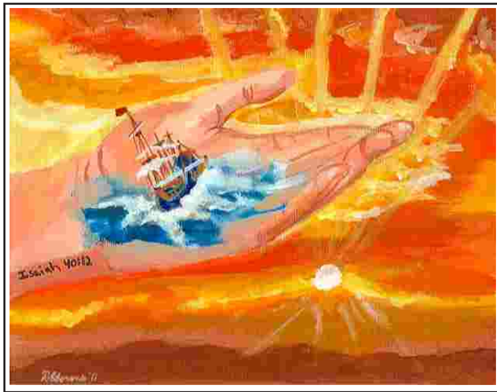
Peace Amidst The Storm

This is the last painting that I created in 2011. It is an acrylic painting showing how we can weather a storm in our lives, with the Lord's protection. This came about after listening to a teaching by Beth Moore called, "Wrecked But Not Ruined" based on Acts 27-28:1-6, which talks about the Apostle Paul's shipwreck experience and how the Lord used Paul to direct all aboard the ship to safety. Although the ship crashed, all the lives were spared. Also in Isaiah 40:12 it says "Who hath measured the waters in the hollow of his hand, ...". It is encouraging to think how the Lord holds onto us in the midst of any storm, if our lives belong to Him. When we know that He is in control we can trust Him to bring us to safety and place us where we need to be. I pray that you are encouraged by this. God Bless you.