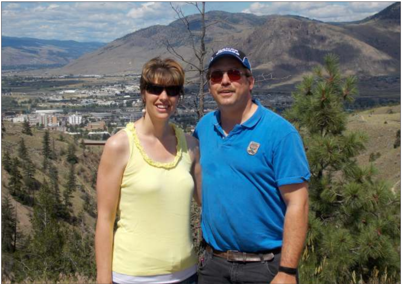
Cover photo: Powell River, BC