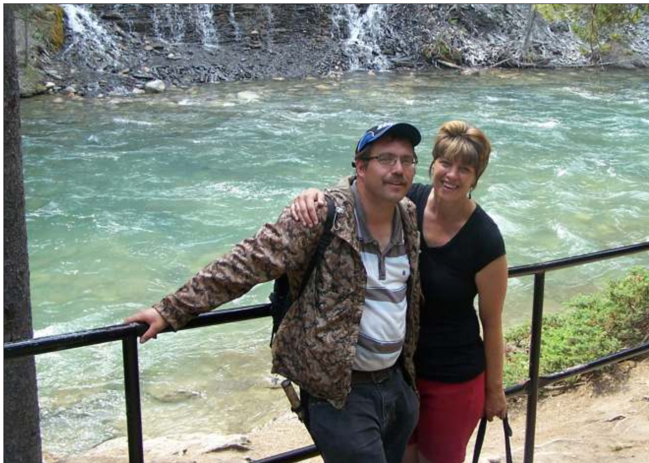
Cover photo: Jasper, Alberta