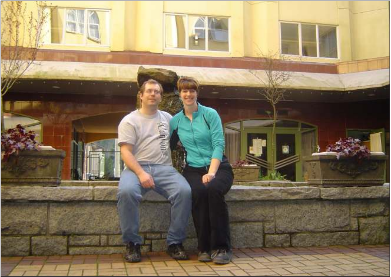
Cover photo: painting of Charles Darwin by Ramona Stevens